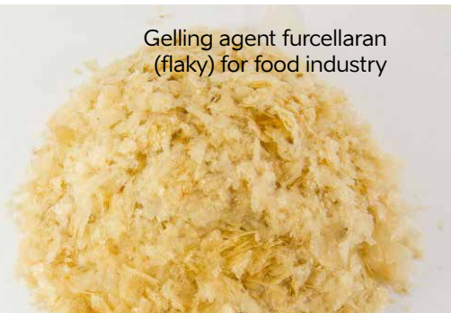
Gelling agent furcellaran (flaky) for food industry