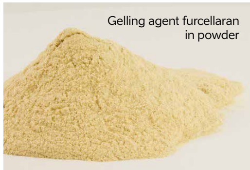
Gelling agent furcellaran in powder